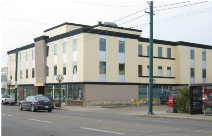
The Zurich Building Re-Face, downtown Edmonton.

start Tri-Tec since they knew a lot of potential clients in the downtown core. In the beginning Tri-Tec secured most of its work with Oxford Properties Group, and later diversified to work with school boards and other property groups."